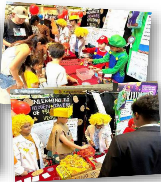
Our Science Buskers performed live to the public during the Final Round at Sengkang Grand Mall