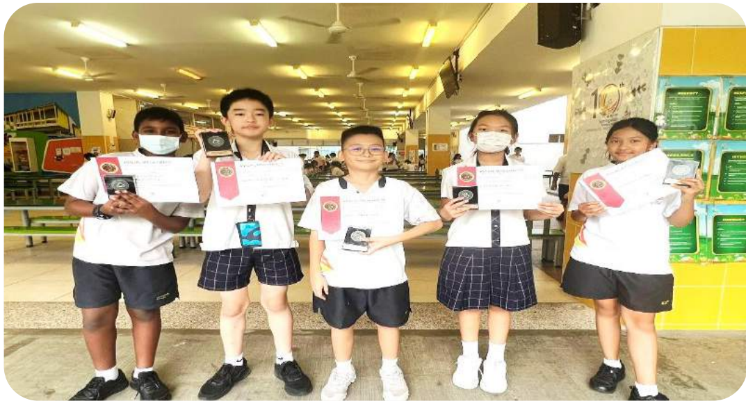
Mathlympics 2023 Medallists

We achieved 1 Silver Medal and 4 Bronze Medals. Congratulations to all our winners and participants who put in tremendous effort to prepare for this competition.