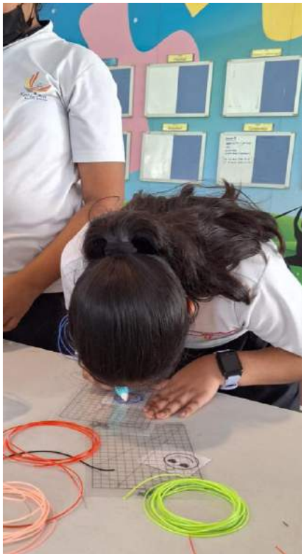
Using 3D pen to design smile keychain