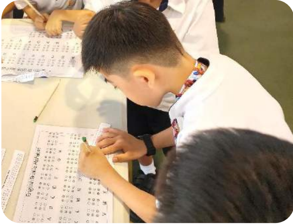
Writing own name in Braille

The SEN Awareness campaign is carried out in October this year with the focus on People with Disability. During recess, students visit booths to learn about and experience the challenges people with physical disability, visual disability and hearing impairment may have in their daily life.