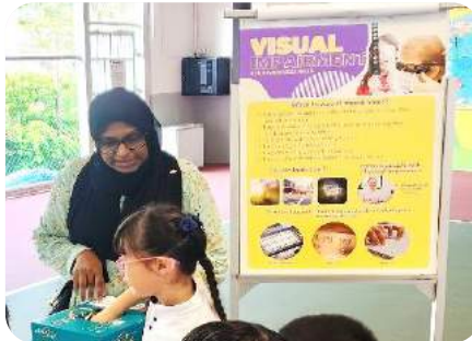
Search for things without looking