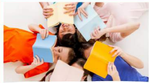
Read a new book