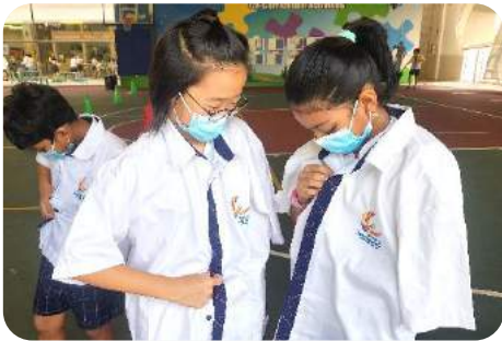
Buttoning up a shirt with only one hand

Students also get to experience the various tools that people with disability used for communication such as sign language, braille and a wheelchair.