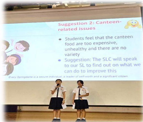
Student Leader Council Members from the Student Well-Being Team leading the Town Hall Discussion