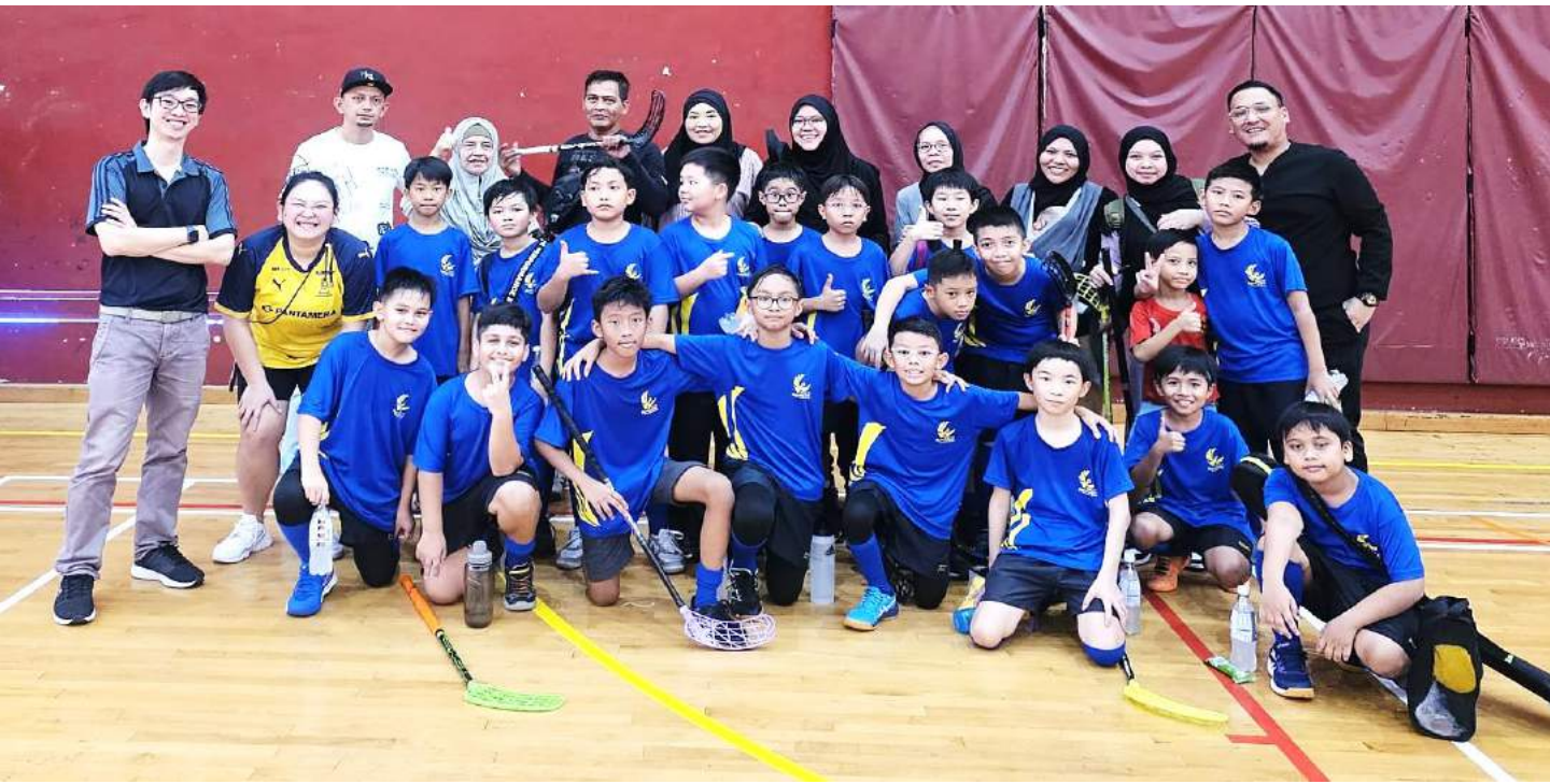
The Junior Boys team with parent supporters at the National School Games

In a thrilling journey spanning from 11 July to 24 August, our school floorball team participated in the National School Games (NSG) Junior Boys floorball competition. Securing second place in the Classification Round, they earned a spot in Tier 1 of the Tiered Round, the highest level of competition.