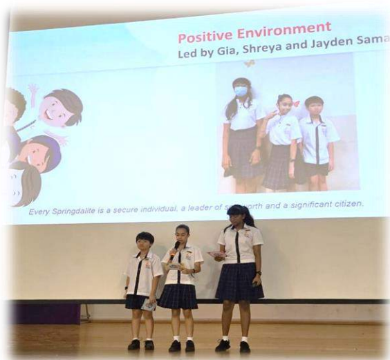
SLC Members from the Positive Environment Team leading the Town Hall Discussion