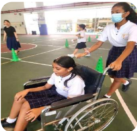
This is what it's like to be on a wheelchair