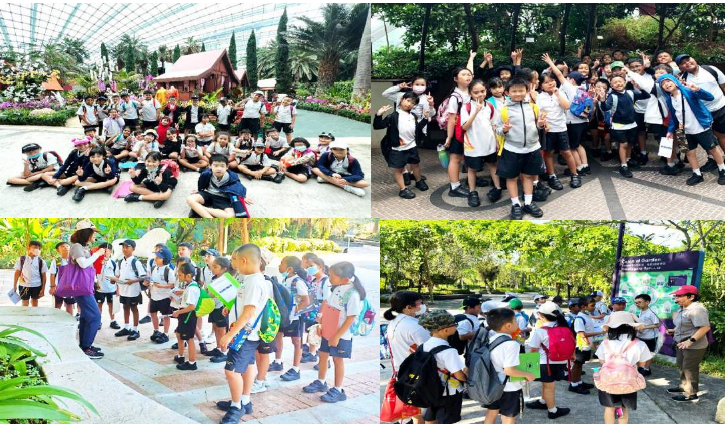
Springdalites listening intently to the guides and having fun exploring Flower Dome

Our Primary 2 Springdalites went on their cohort Learning Journey to Gardens by the Bay on 12 to 14 September 2023.