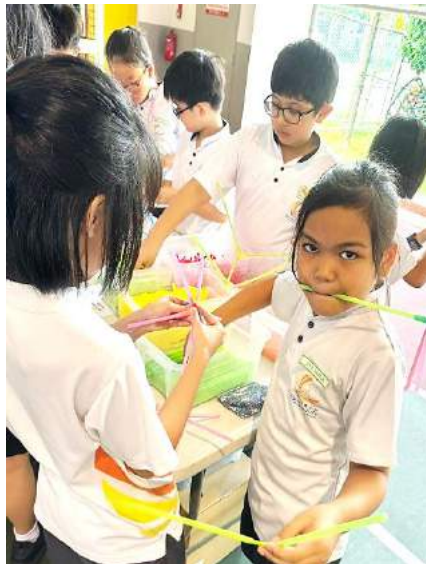
Eager to make their own creation