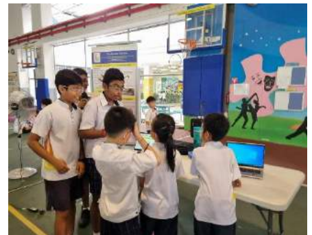
P5 Innovation Programme (IVP) – The Genius Glass