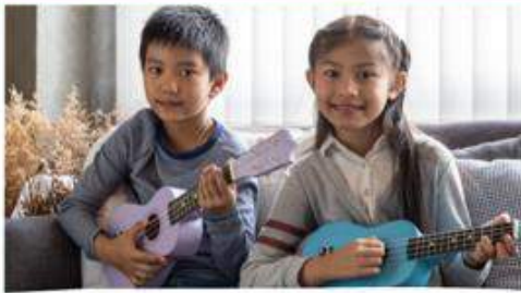
Pick up a new hobby