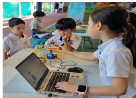
LEGO spike and coding