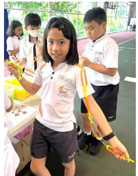
Using Strawbees to make into a long snake