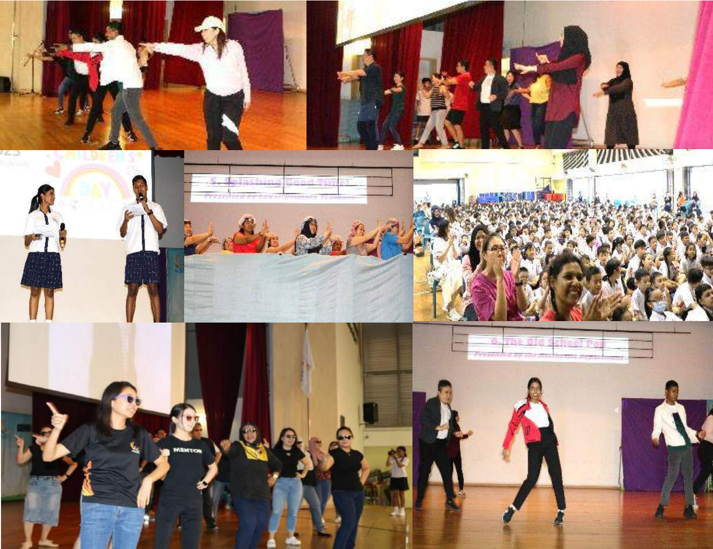
Performances by our talented teachers

Our teacher emcees not only surprised everyone as they came in the school uniforms, but also amazed the audience with their eloquent and humorous conversations.