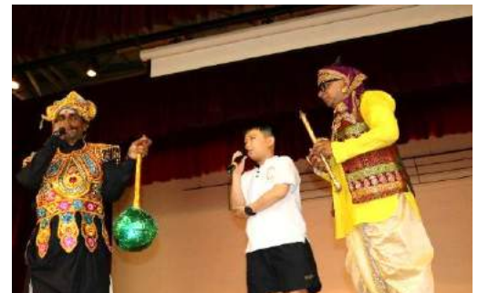
Springdalites took part in a quiz on 'Deepavali' too!