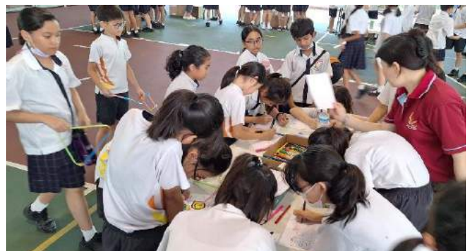
Creating holiday planner