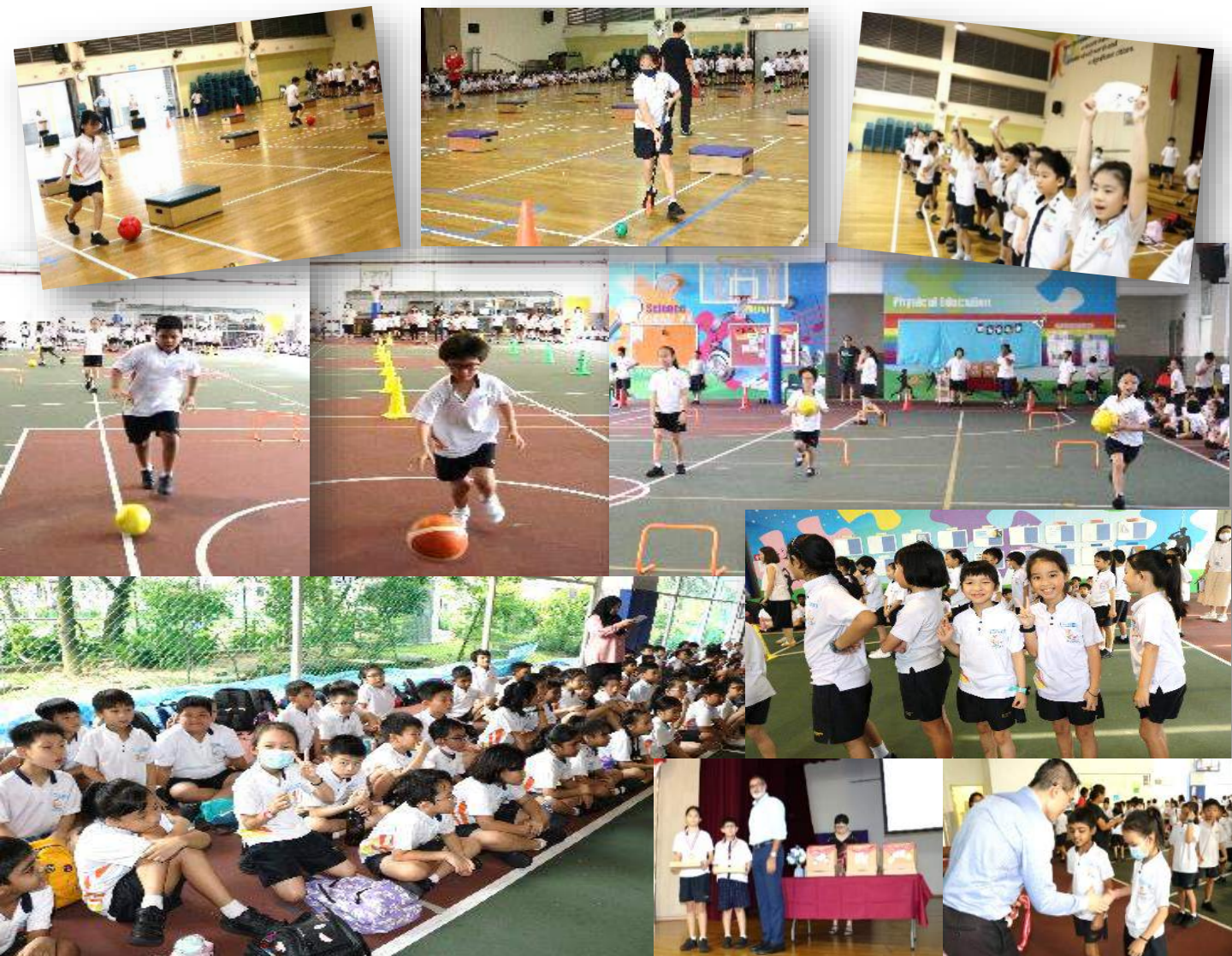
Our Springdalites enjoying the Games Carnival during Children's Day

The school organised a Games Carnival as part of Children's Day celebration for P1 to P3 students. Students had a fun time and at the same time, put into practice the fundamental motor skills that they have learnt during PE lessons. Through the games, students had the opportunity to appreciate and respect each other's strengths and weaknesses and to also put aside individual differences to achieve a common goal.