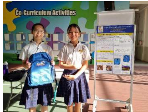
P5 Innovation Programme (IVP) – Organising our homework