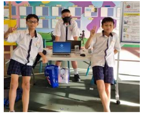
P5 Innovation Programme (IVP) – Anti-slip Cover