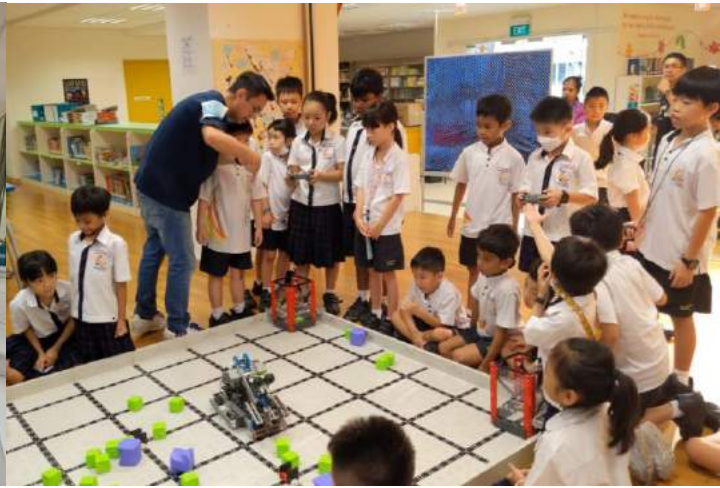
VEX Robotics Challenge – One Minute to Win It: Springdalites had to grab as many cubes as they can in 1 minute!