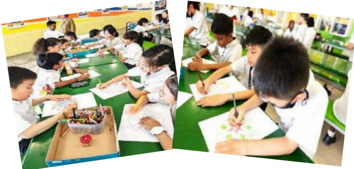
Springdalites enjoyed colouring their Kolams