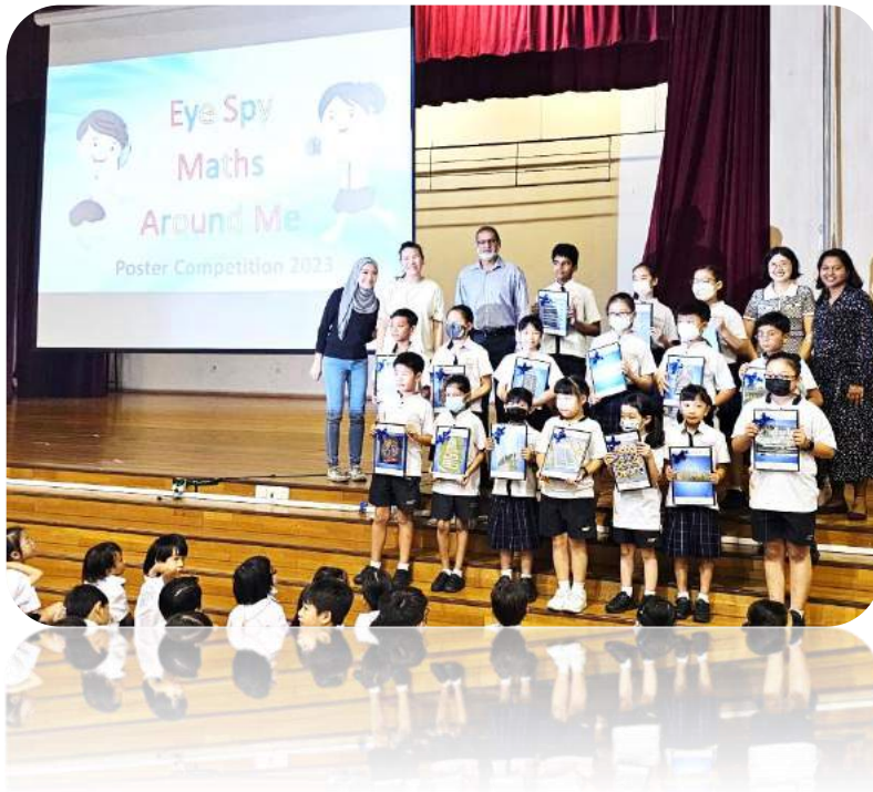
Eye Spy Maths Poster Competition Winners

The competition was open to all levels and many of our Springdalites participated in it. The Top 3 poster designs from each level were presented to the school on 18 August 2023. Congratulations to our winners!