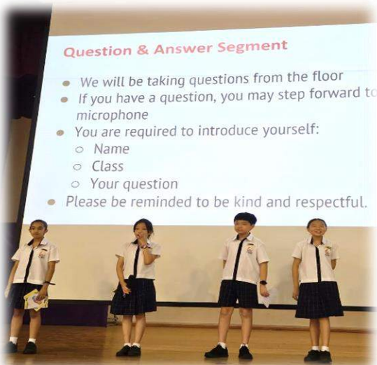
SLC Members from the Development and Outreach Team leading the Town Hall Discussion

The Town Hall Meeting is a platform for the Student Leader Council (SLC) to engage with the student body. During the session, our council shared ideas and suggestions collected from the school population and listened to the voices of our fellow Springdalites, to seek ways to collaboratively enhance our school environment. The student leaders believe that together, everyone can make the school a better place.