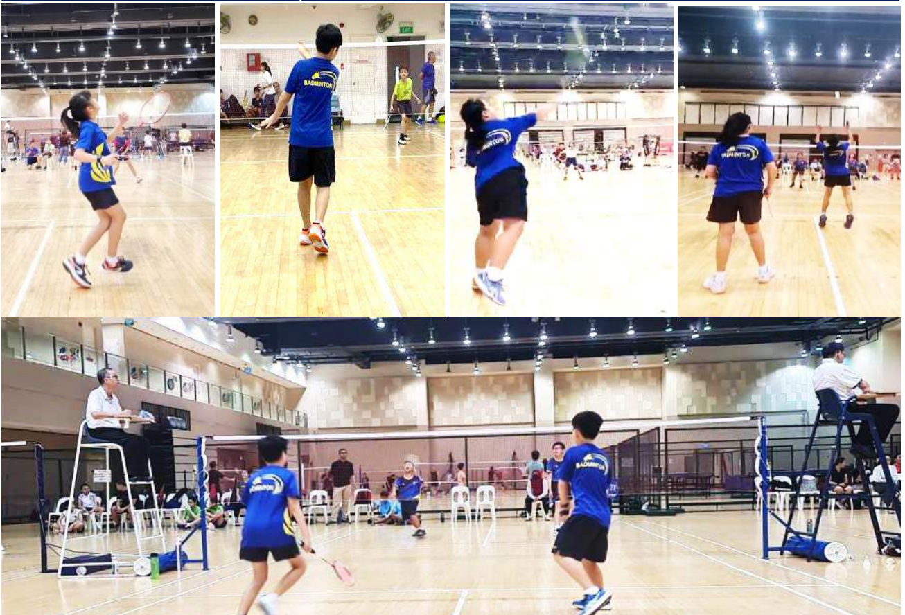
Springdalites in action during the National School Games - Badminton!