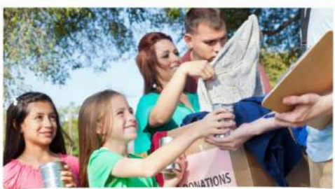
Take part in charity events