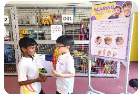
Form alphabets with my finger