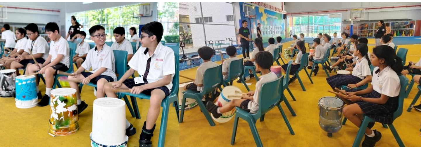
More green drumming during recess time.

In addition to the joy of making music, playing rhythms on recycled drums also sparks important conversations about environmental sustainability for our Springdalites.