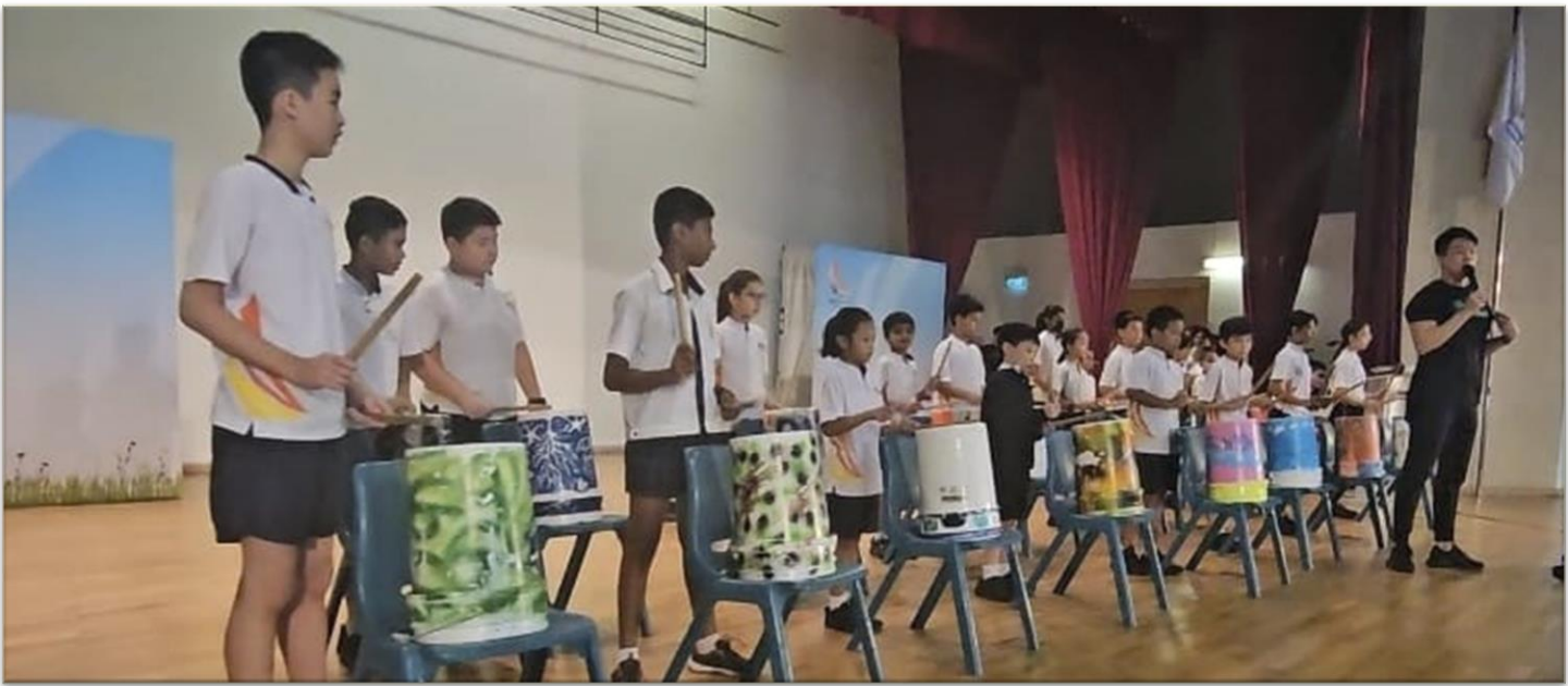
Springdalites invited on stage to experience green drumming.

Springdalites were treated to an assembly performance by musicians from Green Drumming , the first recycled drumming group in Singapore. Students were inspired by how music can be made from everyday items.