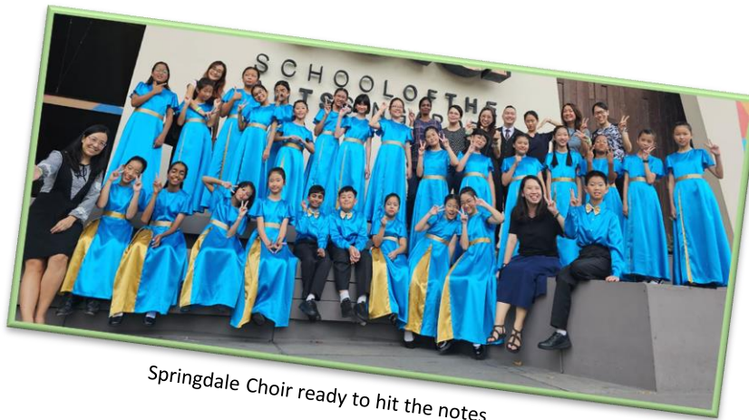
Springdale Choir ready to hit the notes.

The SYF Arts Presentation is a biennial platform to celebrate youth vitality through the showcasing of diverse artistic talents and creativity.