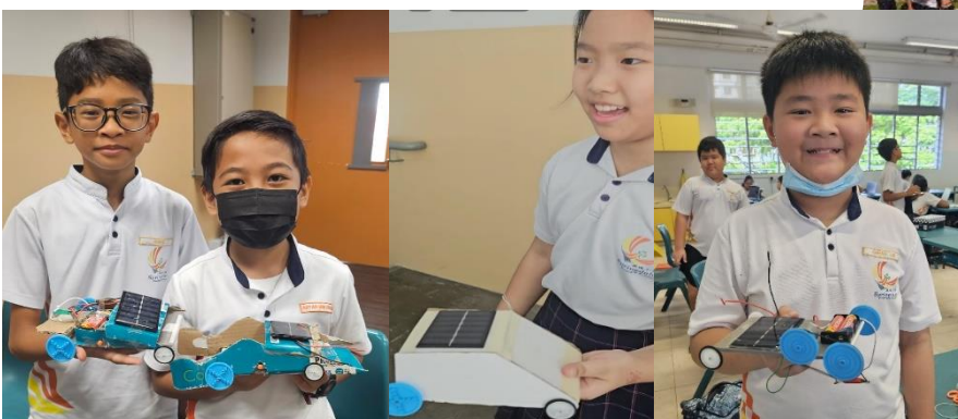
Springdalites with their creations during Project STEAM.