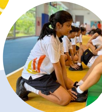
Cheering each other on!