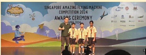
The team won 3 rd place in the Presentation Award