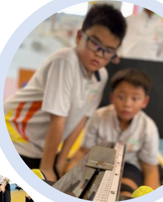
Reaching for success at the Sit and Reach station.

The school conducted a fitness test assessment (NAPFA) for Primary 4 and 6 students to support their physical health and well-being. During the test, the students enthusiastically cheered for their classmates as they pushed themselves to excel in the various stations. Well done, Springdalites, for demonstrating perseverance and determination!