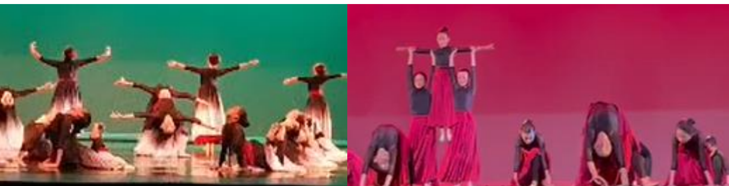
Performance by Springdale International Dance team.

Our Choir CCA achieved a Certificate of Commendation, while our International Dance CCA earned a Certificate of Accomplishment at the SYF Arts Presentation 2024. Congratulations to our dedicated students whose hard work has truly paid off.