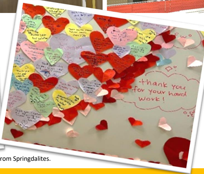
Thank-you notes from Springdalites.