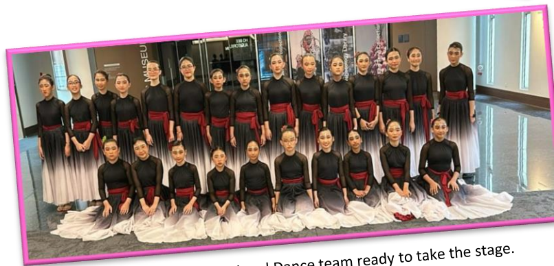
Springdale International Dance team ready to take the stage.