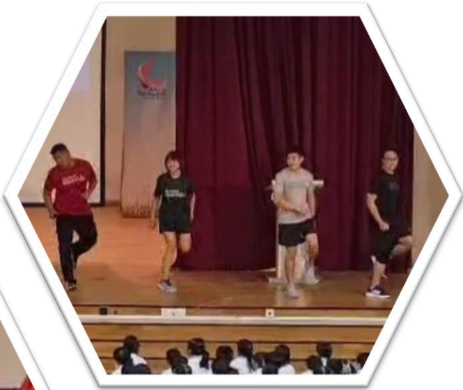
Superhero SPARK and PE teachers dancing to the campaign song.