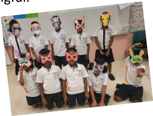
Learning symbolisms of traditional masks

This year, the two-week programme was organised from 18 March to 28 March. It offered students a hands-on opportunity to learn and appreciate their Mother Tongue Languages and cultures.