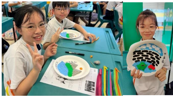
Oriental landscape modelling