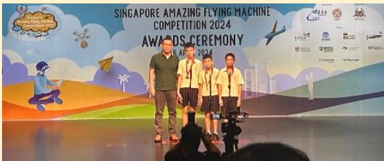
The team won 2 nd place in the Time Aloft Award