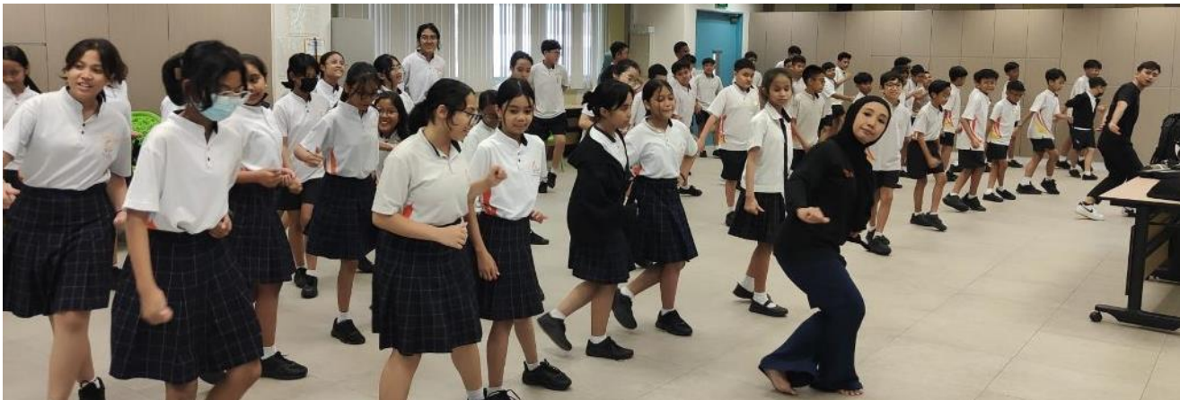
Learning the traditional Malay dance, Tarian Zapin