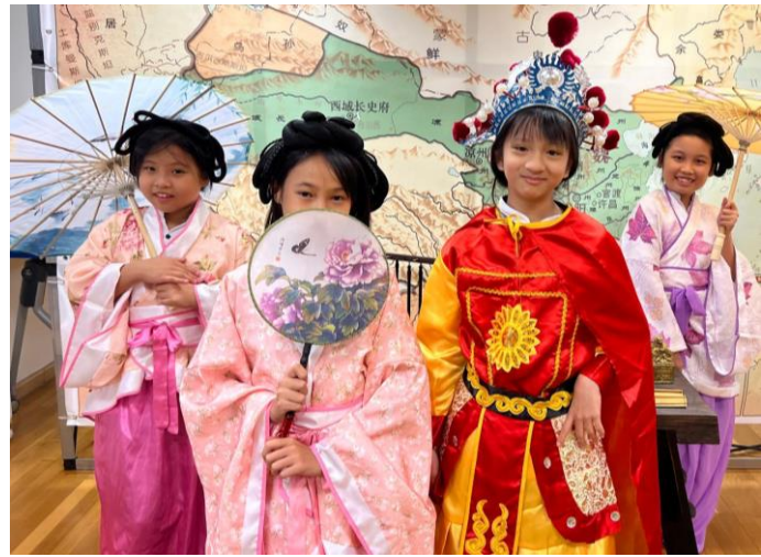
Having fun dressing up in traditional clothes.