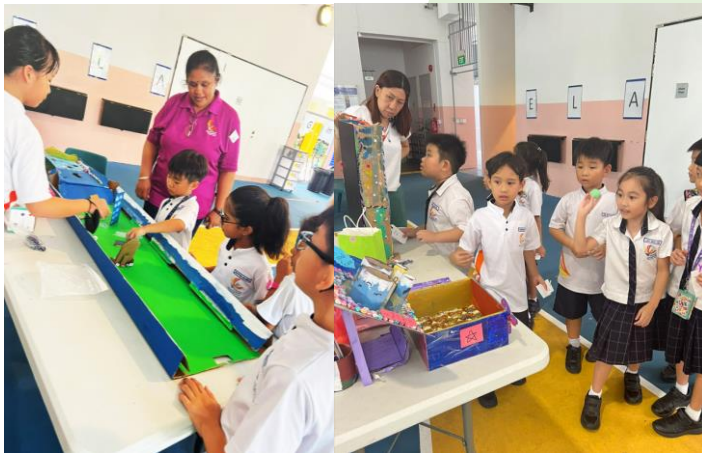
Students playing games made from recyclable materials.