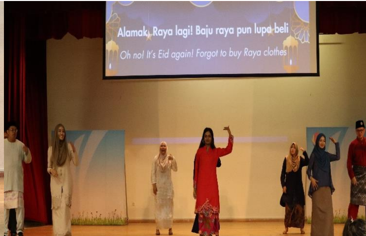
Teachers performing to the crowd-favorite Hari Raya song 'Alamak Raya Lagi'.

Springdalites also participated in various recess activities, including crafting Hari Raya money packets, making lanterns, writing wishes on Hari Raya cards and singing festive songs played during recess. These activities further enhanced the celebratory atmosphere.