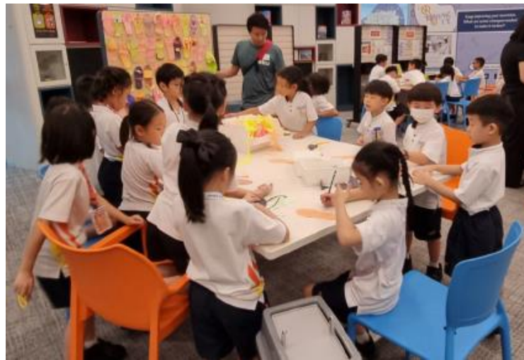
Engaging in a craft activity at One Punggol CC.

They were guided to observe their surroundings and participate in group discussions to describe what they saw and share their thoughts with others. This helped foster a sense of belonging and care for their community.