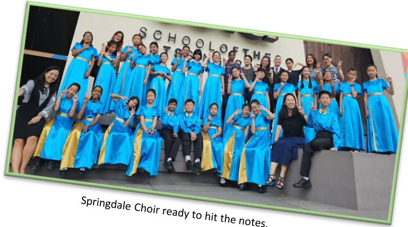
Springdale Choir ready to hit the notes.

The SYF Arts Presentation is a biennial platform to celebrate youth vitality through the showcasing of diverse artistic talents and creativity.