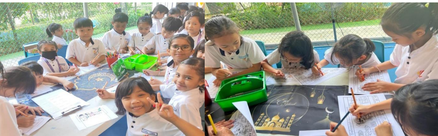
Springdalites crafting Hari Raya money packets and writing wishes on Hari Raya cards.

Springdalites also participated in various recess activities, including crafting Hari Raya money packets, making lanterns, writing wishes on Hari Raya cards and singing festive songs played during recess. These activities further enhanced the celebratory atmosphere.