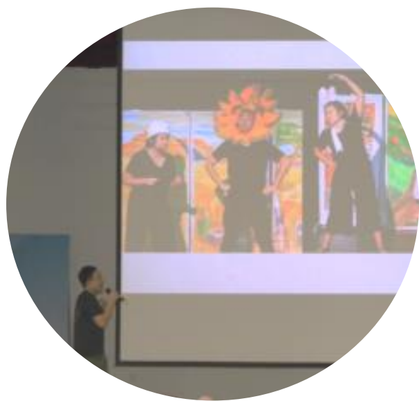
Engaging Springdalites in an assembly activity.

Our school commemorated International Friendship Day (IFD) on 5 April. The theme for this year is ‘Singapore in Asia’. By celebrating diversity and promoting friendship, we hope Springdalites will learn to recognize each other’s uniqueness as strengths.