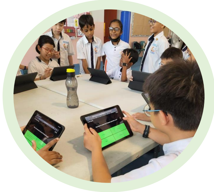
Springdalites penning their Earth Day Pledge.

In partnership with Alba Waste Management, the school had our first e-waste recycling drive. Springdalites attended an insightful assembly talk by a representative from Alba Waste Management to learn more about the importance of recycling and proper e-waste disposal.