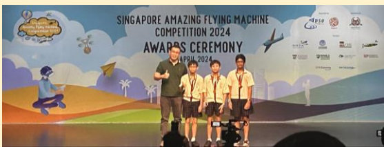
The team won 3 rd place in the Presentation Award