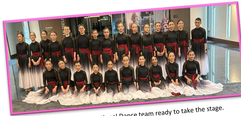
Springdale International Dance team ready to take the stage.