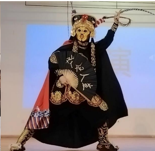
Sichuan face-changing performance