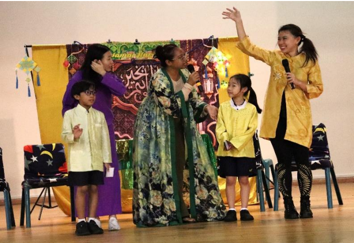
Engaging the audience through a Hari Raya play.

The school celebrated Hari Raya with a concert on 12 April. Springdalites learned about the significance of Hari Raya and the importance of staying connected in the digital age. The lively performance had everyone buzzing with excitement, especially when some students were invited to join the show.