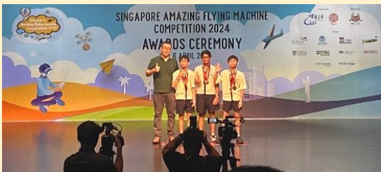
The team won 2 nd place in the Championship Award

They prepared very hard for the competition and their efforts paid off when they won three awards! One team was even selected as the static display team to present to the guests during the Awards Ceremony. It had been a great learning experience for our Springdalites and we are very proud of their excellent achievements!