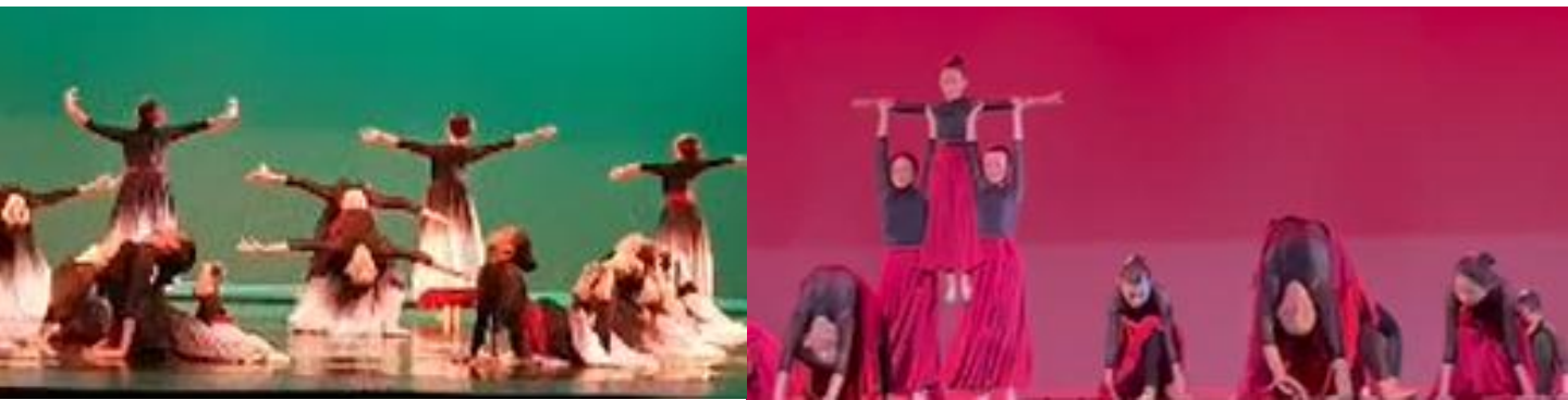
Performance by Springdale International Dance team.

Our Choir CCA achieved a Certificate of Commendation, while our International Dance CCA earned a Certificate of Accomplishment at the SYF Arts Presentation 2024. Congratulations to our dedicated students whose hard work has truly paid off.