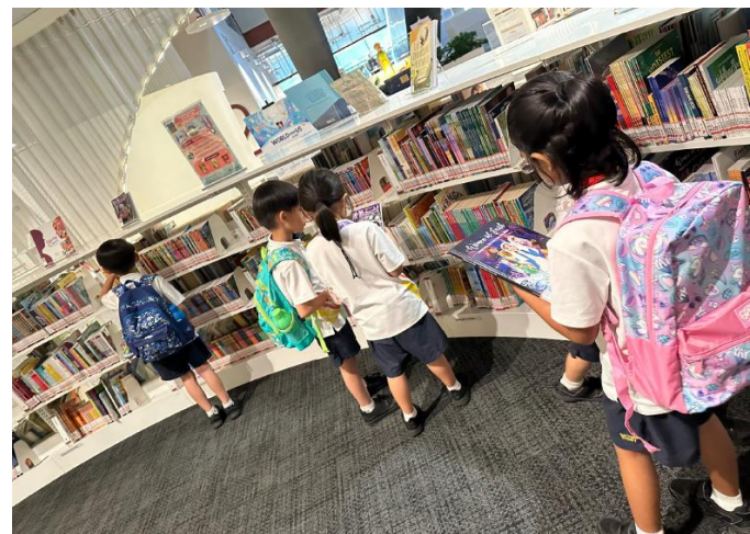
Exploring the facilities at Punggol Regional Library.