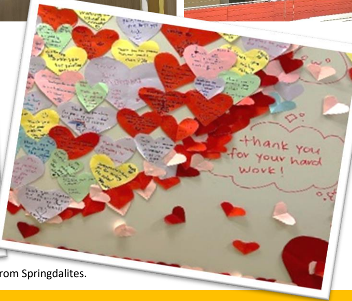
Thank-you notes from Springdalites.