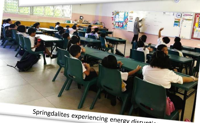
Springdalites experiencing energy disruption