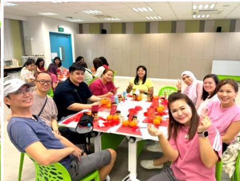
Our PVs had a wonderful time bonding together