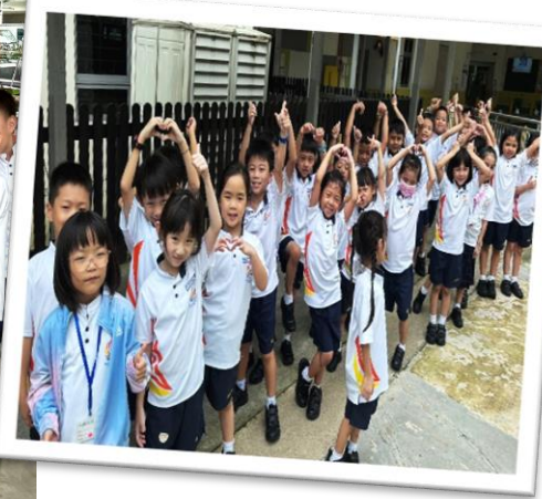
We are ready for the walk!