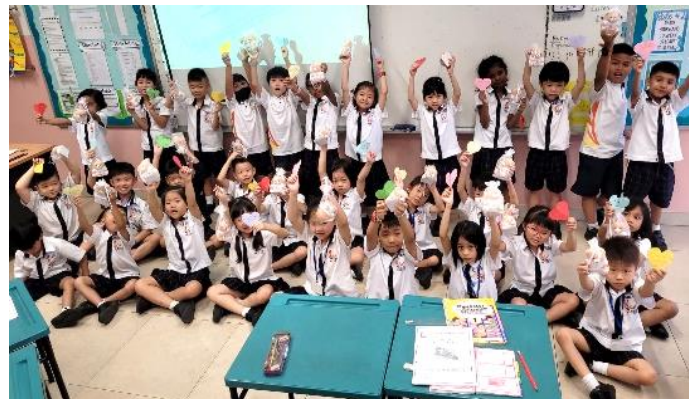
A short Welcome Speech by the Primary 4 Class Monitors