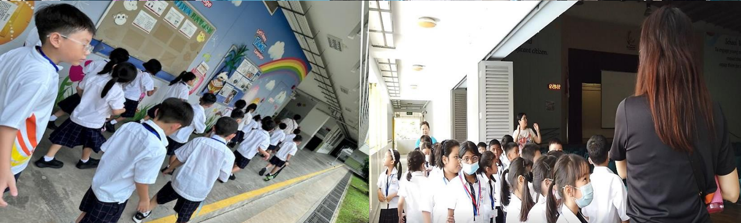
Ready to start the day with our teachers!