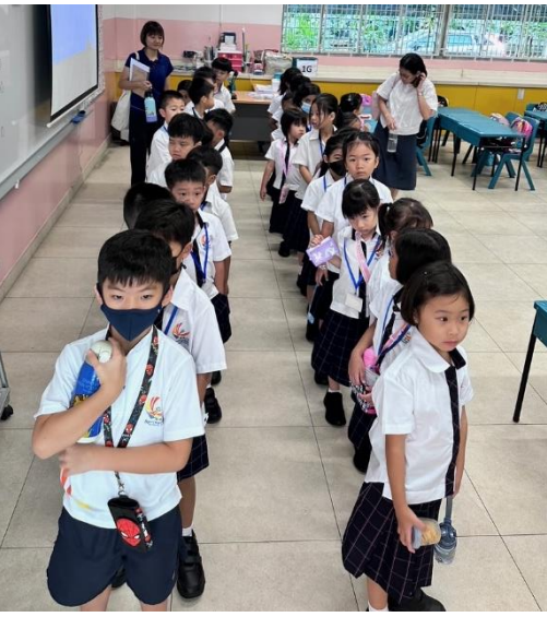
Getting ready for recess