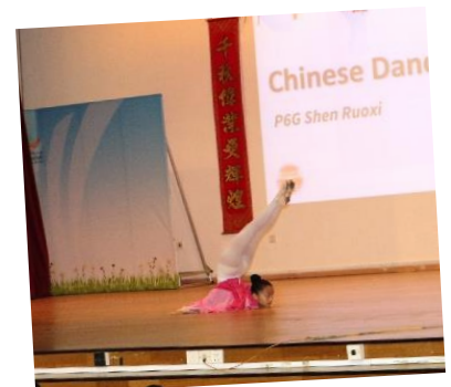
Our Springdallites showcasing their talents and skills through a variety of performances