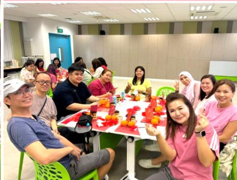
Our PVs had a wonderful time bonding together