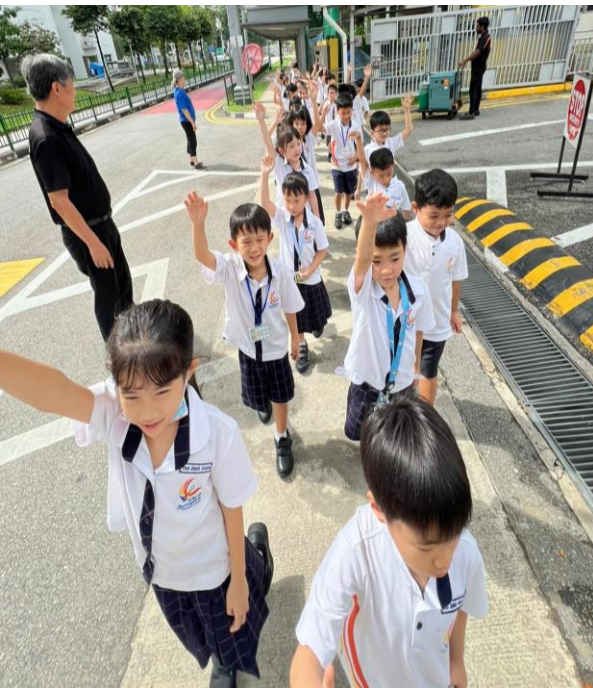
Practising kerb drill when crossing the road