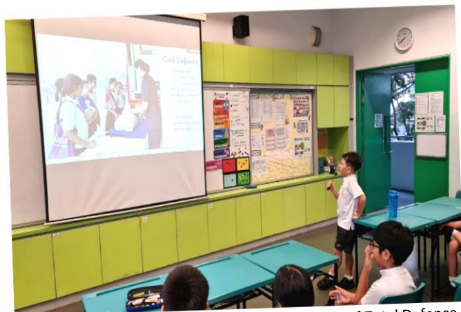
NESS Monitor sharing about the six pillars of Total Defence