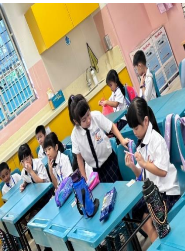
Settling into the class