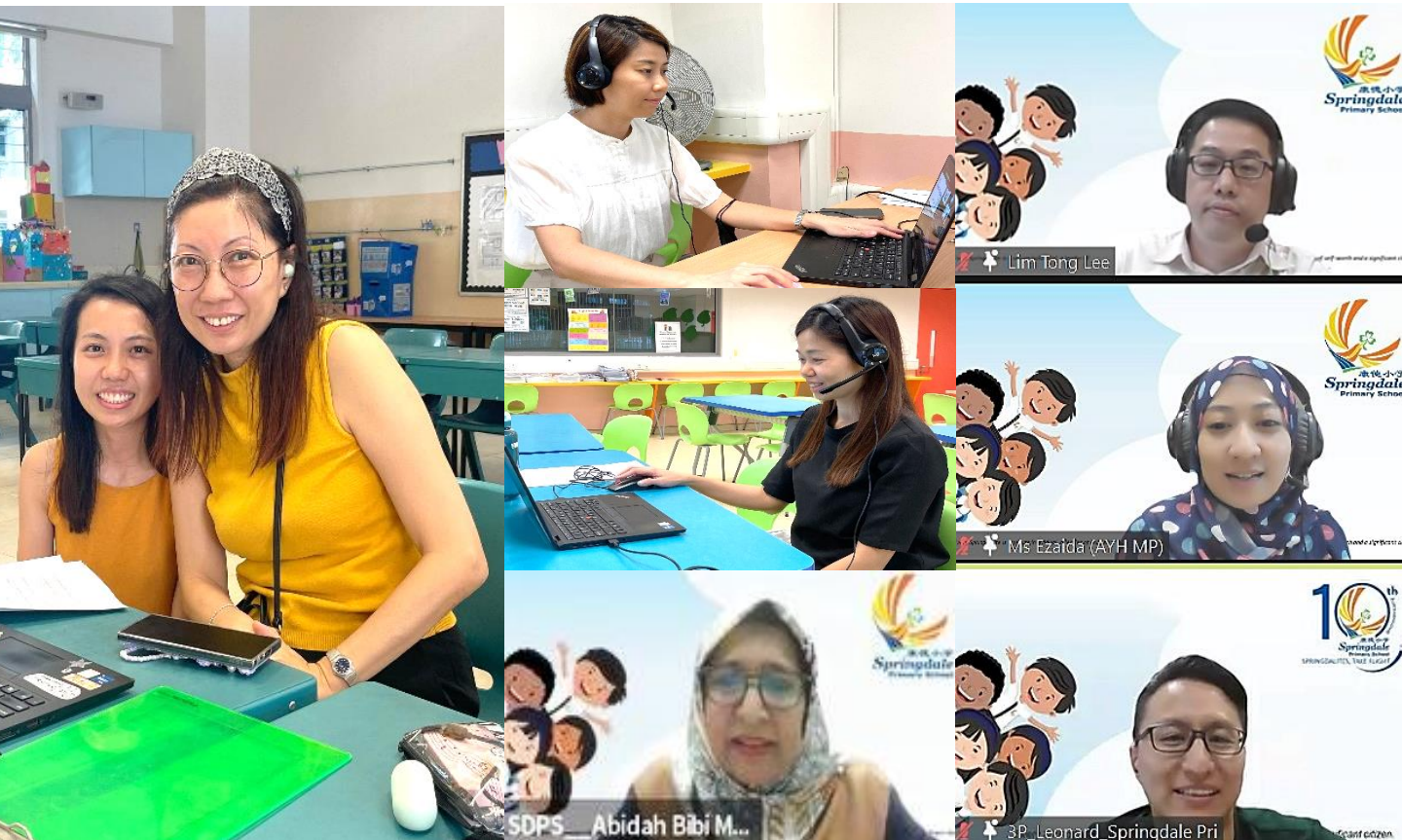
Our Year Heads, Key Personnel & Form Teachers conducting the Parents' Briefing