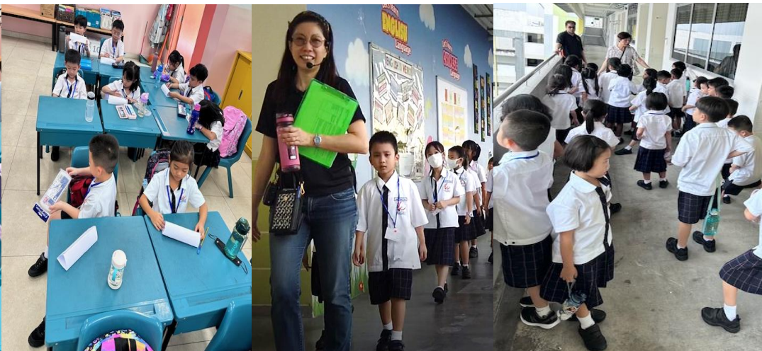
Touring around the school