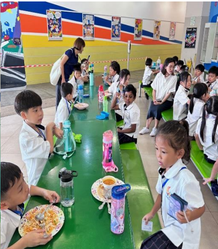
Enjoying the interaction with friends and teachers during recess