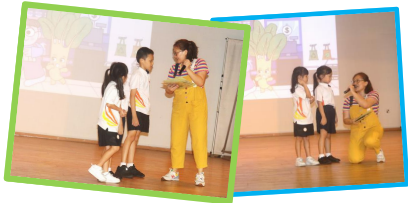
Springdalites attempting the quizzes