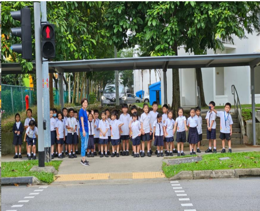
We learned how to be a safe road user