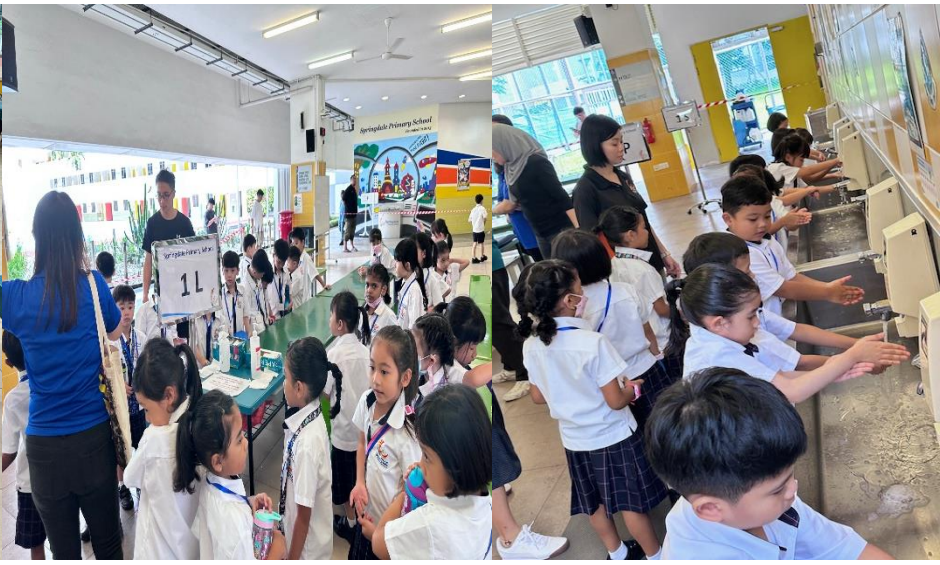
Handwashing routines during recess