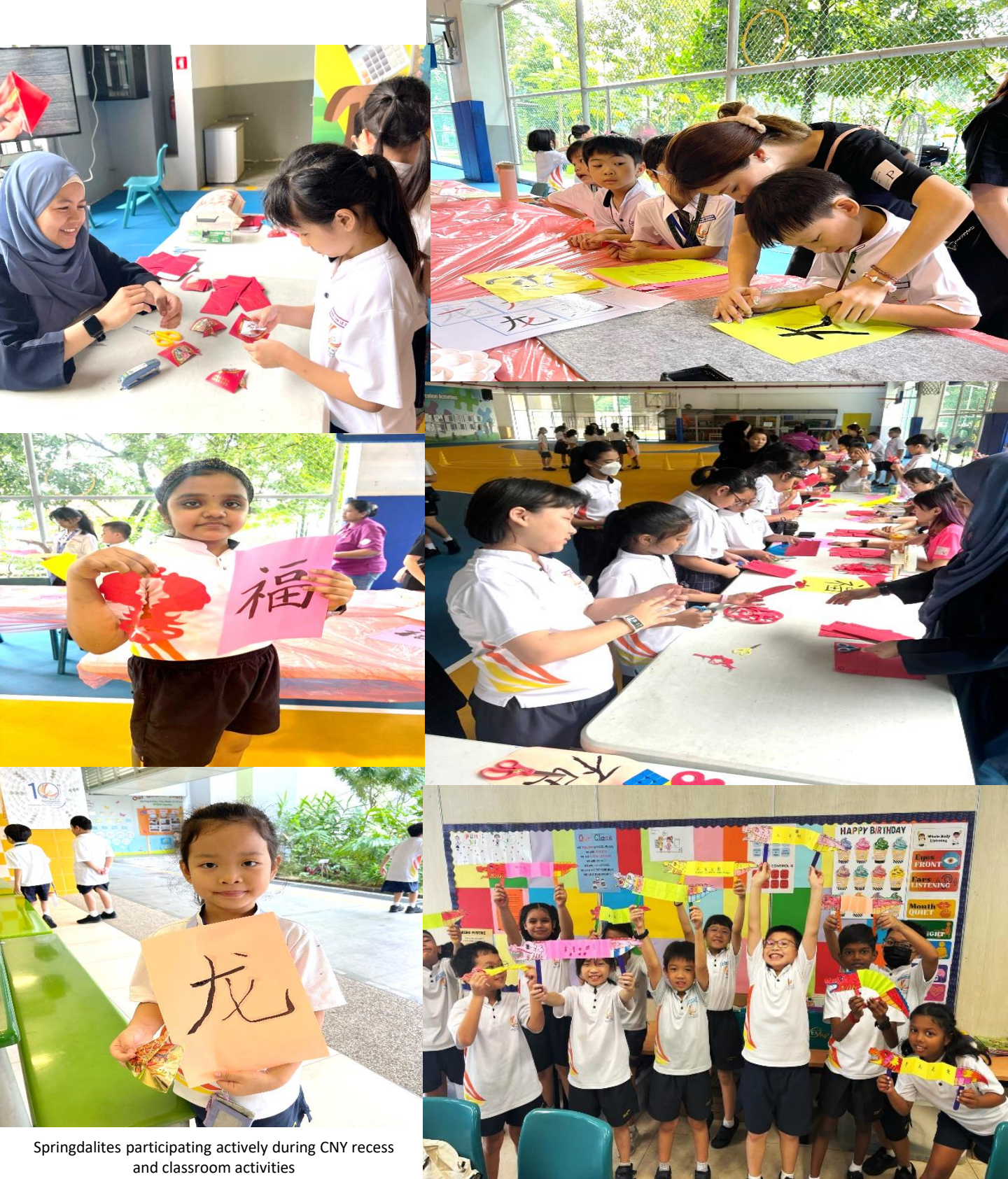
Springdalites participating actively during CNY recess and classroom activities