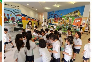
P1 to P4 Recess activity