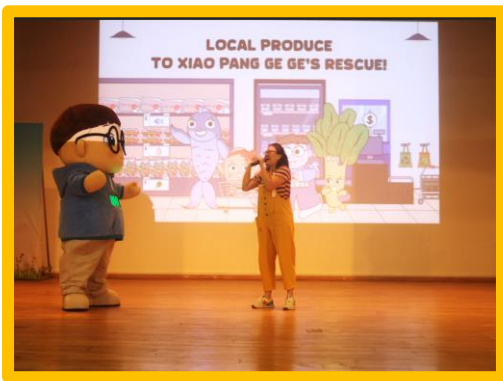
Characters in the assembly talk

As part of Eco-stewardship, the school organised a lively skit featuring captivating mascots to highlight the importance of local produce. Students were captivated by the endearing characters and gained valuable insights into food security and the advantages of supporting local produce.